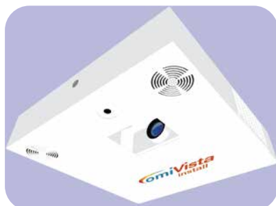
Fixed ceiling system projecting onto a floor or table.