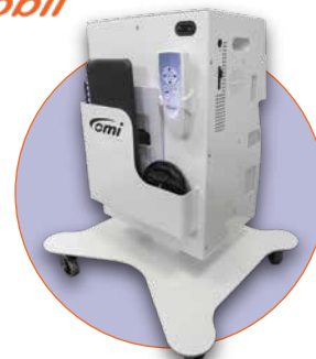
Portable and electrically height adjustable system projecting onto a table, bed or floor.