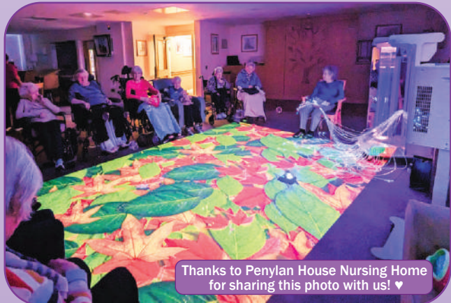
Thanks to Penylan House Nursing Home for sharing this photo with us! ♥